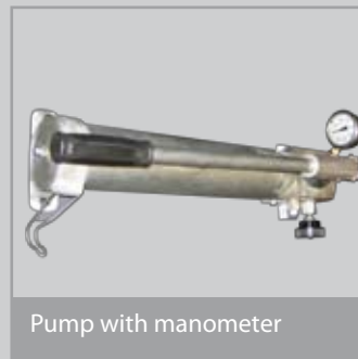
Pump with manometer