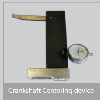
Crankshaft Centering device